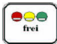
Additional sign to 270.1